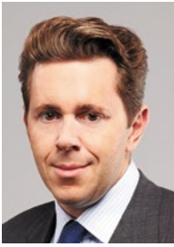
Dr. Harald Mahrer State Secretary in the Federal Ministry of Science, Research and Economy