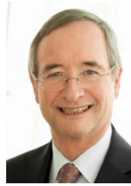
Dr. Christoph Leitl President of the Austrian Federal Economic Chamber

... Pioneers ... passion ... motivation ... successful social change ... innovation ... start-ups ... networking ... driving the knowledge society ... high international esteem.