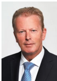
Dr. Reinhold Mitterlehner Vice Chancellor and Federal Minister of Science, Research and Economy