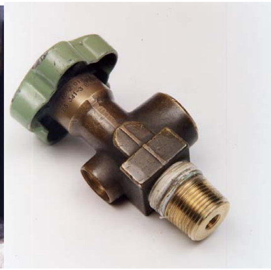
Markings can be obscured by valve handle