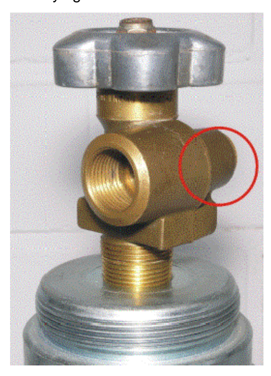
Annex 1 Identifying marks